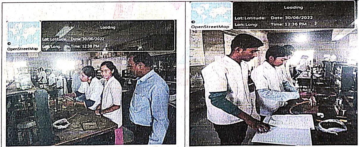
Students while performing the soil analysis

Acidity of the Soil : Using the litmus paper and also by titration method.